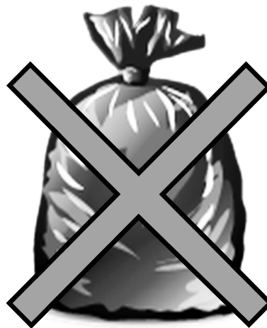
NO PLASTIC BAGS!